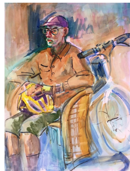
Top to bottom; left to right: 1. Another Perfect Day 2. Kailua Perch 3. Chalee and Her Dog 4. Kimono 2 5. Fishing the Ala Wai 6. Gear