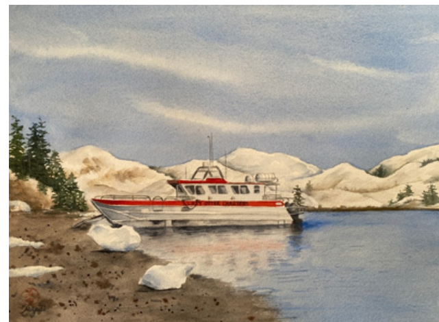
Clockwise from top: 1. Heavenly View 2. Spring Beauties 3. Alaskan Beach 4. Raindrops on Summer Snowflakes