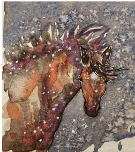
Janna Mihara, "Snow Day"