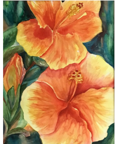
Sherry Cavin, "Happy Hibiscus"