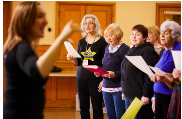
Participants in the research were also asked how often they took part in singing, dancing, paint, photography or crafting.