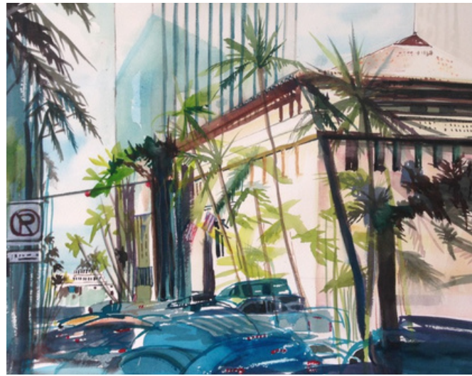
Clockwise from top: 1. Shadow from Banyan Trees 2. Akaka Forest 3. Untitled 4. Travelers Palm II 5. Lotus Garden 6. Waikiki Morning 7. Blessing at Noon