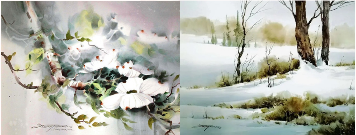
WATERCOLOR PAINTINGS BY JUROR STERLING EDWARDS