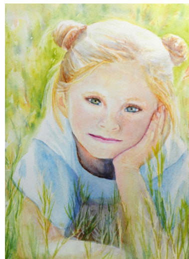
Top to Bottom, Clockwise: 1. Christmas Kitty 2. Canada Lake 3. Enchanted Forest 4. Child 5. Toby's Store Point Reyes 6. Valley of the Temples