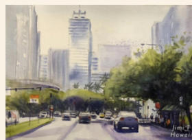
Jimmy Tablante's submission for our "Composition Techniques" Challenge