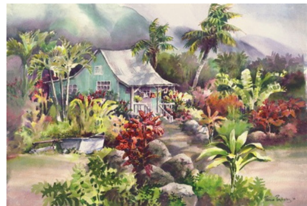
Top to bottom, clockwise: 1. Pua Ma Ole 2. Kalalau Mist 3. Kanaka Homestead 4. Nukuoli'i 5. Toby's Store Point Reyes 6. Mougin Village