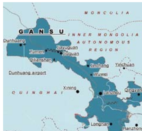
Map of Gansu province

In April this year, Gansu officials came on a three-day cultural industry visit to Hawaii, where they met with counterparts from the Department of Business, Economic Development, &