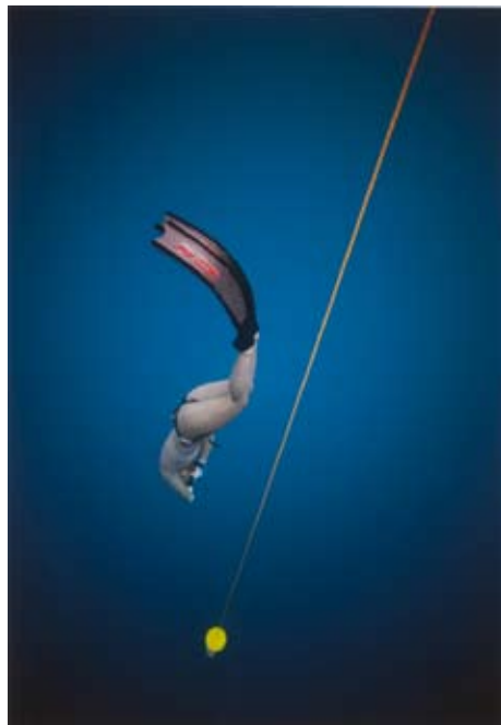
Grace Under Pressure by Sergio Goes

With the closing of accession 2012, mid-August brought the opening of a new accession exhibition to the Hawai'i State Art Museum. Concentrated in the front third of the Diamond Head Gallery, accession features 37 recent acquisitions from the Art in Public Places (APP) Collection. On exhibit for the first time as new additions to the APP collection, these newly acquired works demonstrate the vibrancy and depth of talent of the artists in the Hawaiian Islands.