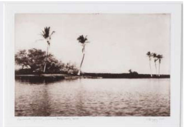
Coconut Grove, c.1957...