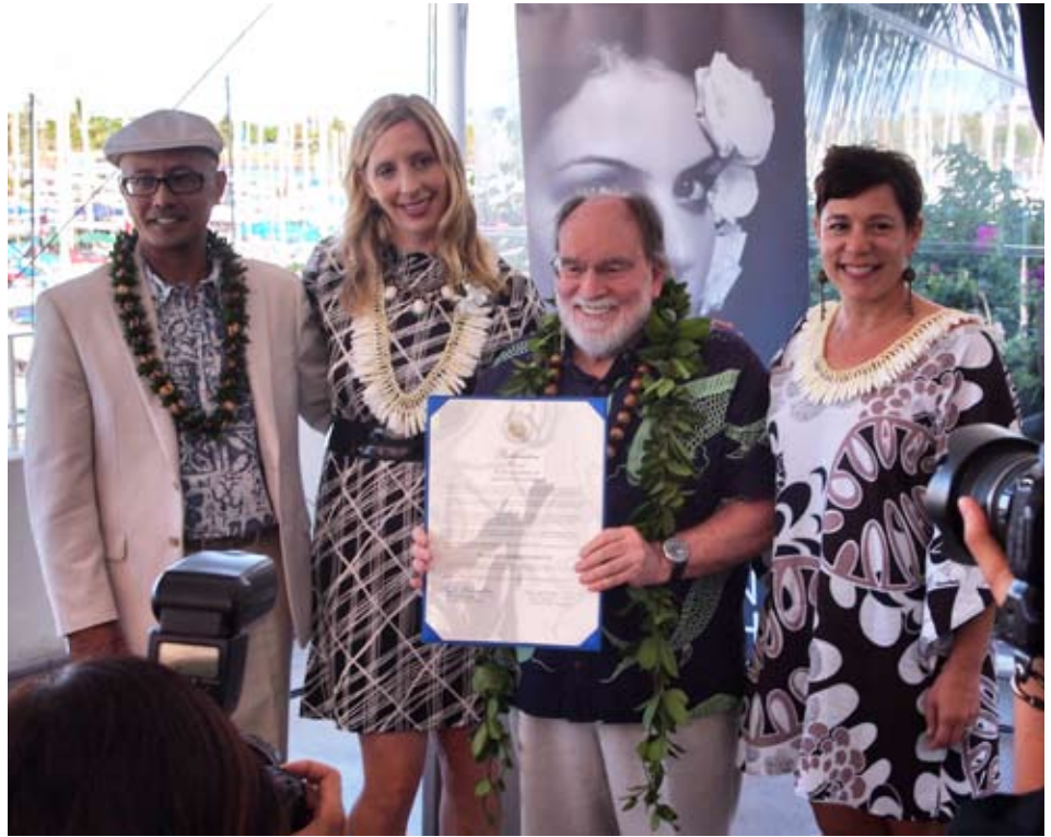
Governor Abercrombie declares October to be Hawai‘i Fashion Month

The Hawai‘i State Art Museum’s First Friday event is free to the public. Grand Café will handle the sale of refreshments. Guests are encouraged to don their most glamorous outfits, preferably black tie and evening wear. Bring a friend, spread the glamour!