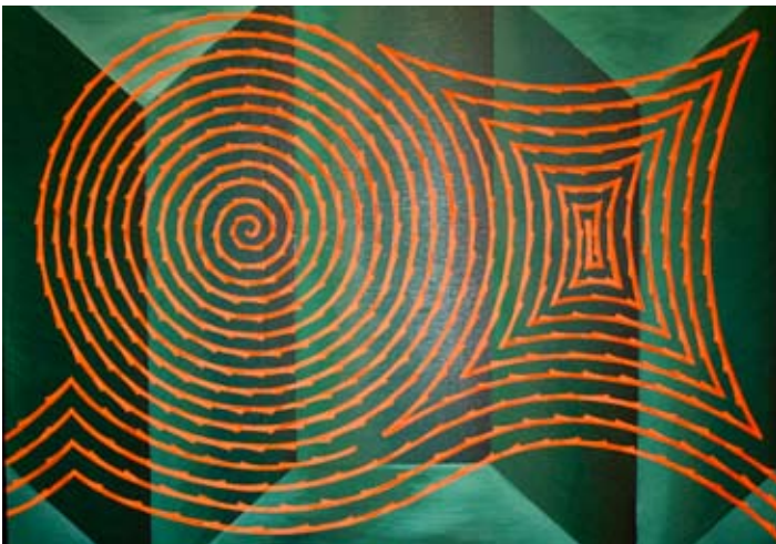
Sunrise Koolau by Hon Chew Hee