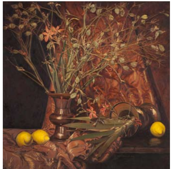
Green and Golden by Snowden Hodges