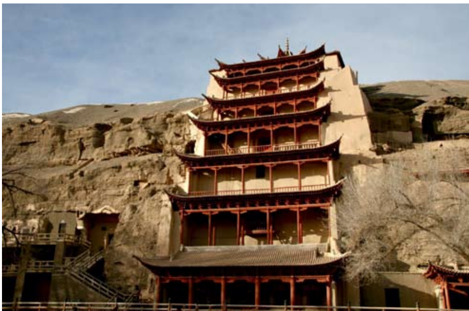
Mogao Caves in Dunhuang, Gansu