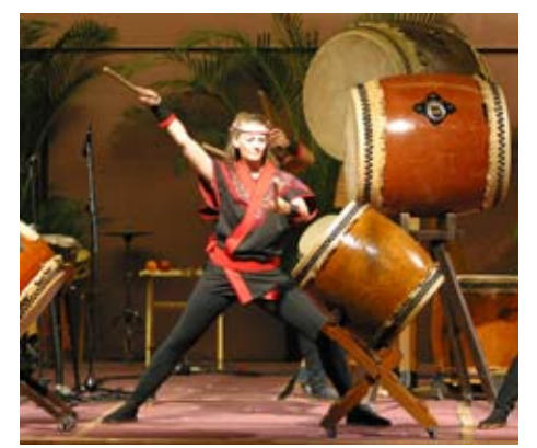
Taiko Center of the Pacific

and the Hawai'i State Foundation on Culture and the Arts. All galleries of the Hawai'i State Art Museum are open to the public during the event, including the two latest exhibitions: "accessions: Recent Acquisitions from the Art and Public Places Collection" and "GIFTED: Donated Works of Art from the Art in Public Places Collection." Food is available from Downtown@HiSAM and the following vendors on the Lawn: Hale Kealoha Ai Pono, India Cafe, Le Crepe Café, Onopops and Kettle Corn Hawaii. This event is produced by Tim Bostock Productions and supported by the Friends of HiSAM.