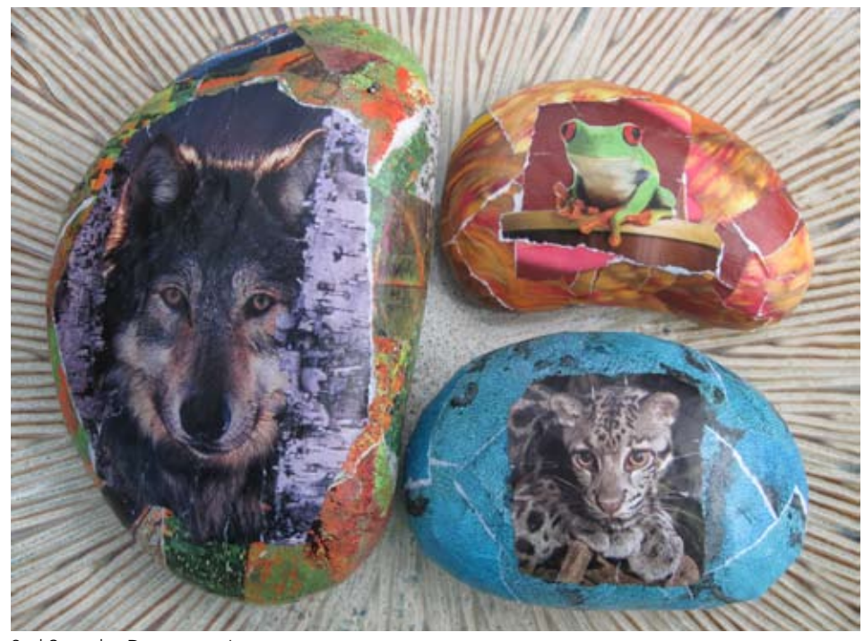
2nd Saturday Decoupage!

Showcase Hawaii Visit Showcase Hawaii, the museum gift store. The store features Hawai'i-made art, gifts, and goodies. It's the perfect place to find a unique gift for that special someone. Open Tuesday through Saturday from 10:30 a.m. to 3:30 p.m. On First Friday, Showcase Hawaii opens again from 6 to 9 p.m. and is on the ground floor of the Hawaii State Art Museum.