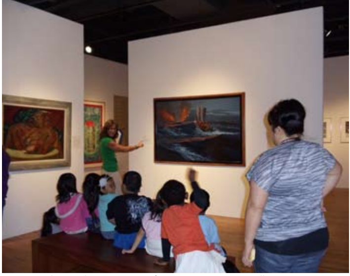
Learning about 'The Discovery of Hawaii' in HiSAM's galleries

and is led by qualified teaching artists from the Artistic Teaching Partners roster. The program begins and ends in the classroom with the teaching artist leading a pre-visit and a post-visit lesson to introduce and then review concepts. During the museum visit, students experience an inquiry-based guided tour in