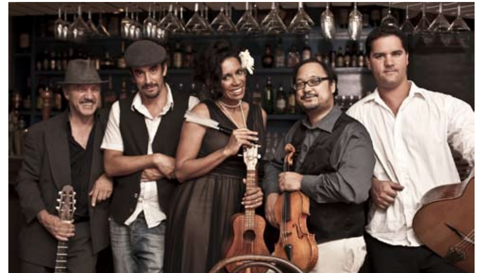
Hot Club of Hulaville