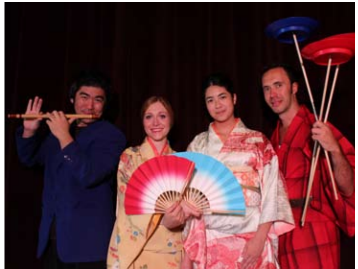
Bento Rakugo.

A production of the University of Hawai'i at Manoa Outreach College's Statewide Cultural Extension Program, HSFCA partners with SCEP for state-wide annual presentation and touring outreach activities. Funding support from the National Endowment for the Arts, the Hawai'i State Foundation on Culture and the Arts, and the Friends of the Library Hawai'i enables a variety of arts & culture presentations at public libraries, which are free and open to the public. The schedule for the month of November 2013 is as follows (consult your local library for any changes):