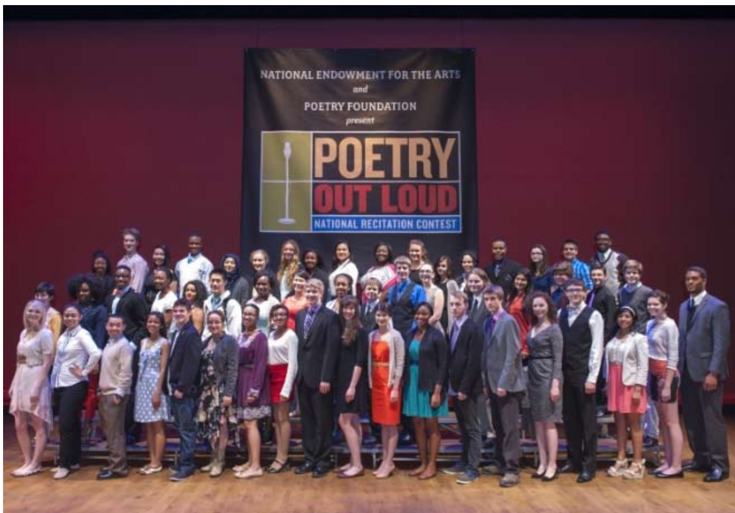
53 champions of all 50 states, the District of Columbia, U.S. Virgin Islands, and Puerto Rico competed over the two days of finals