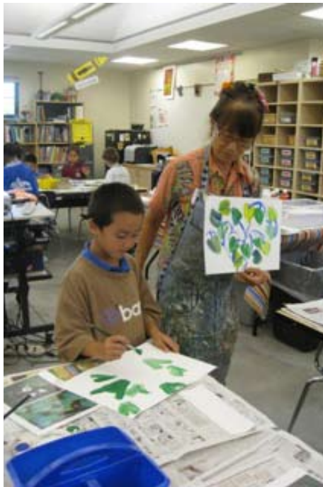
Teaching at Kamehameha Schools Hawai’i Campus in 2013, grades K-5.