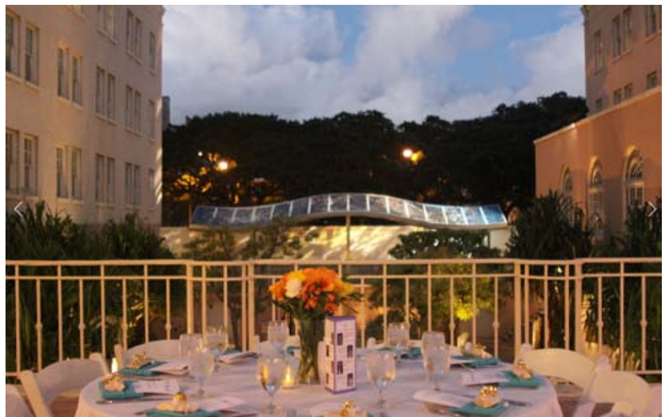
CTL anniversary dinner at HiSAM

The Center for Tomorrow's Leaders engages, equips and empowers Hawai'i's next generation of leaders to start making a difference now. CTL's vision is to create a movement of young leaders of character and competence who reach the critical "tipping point" to create a new era of growth in our schools and communities. Through two