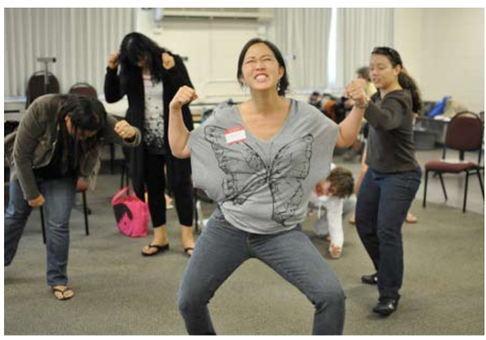
Reading Comprehension Workshop

Through these courses, teachers are expected to implement what they learned in-between the workshop session dates. They then return to the workshop with questions based on actual experiences with their own students. Theory to practice is bridged more easily this way. This practice also offers teachers the opportunity to learn from each other in a 'best practices' exchange and to discuss their students' achievements through arts integrated learning experiences. Teachers earn three DOE professional development credits through these courses.