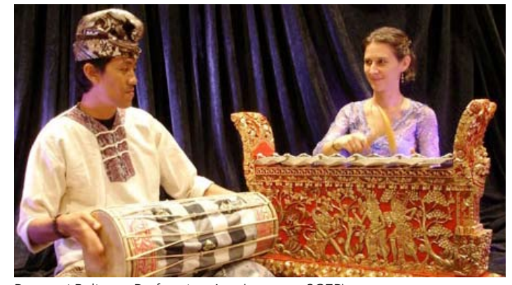
Pasupati Balinese Performing Arts

production of the University of Hawai'i at Manoa Outreach College's Statewide Cultural Extension Program, HSFCA partners with SCEP for annual presentation and touring outreach activities statewide, with funding from the National Endowment for the Arts, the Hawai'i State Foundation on Culture and the Arts, and the Friends of the Library Hawai'i. Presentations may include music and dance from several cultures, Chinese arts and crafts, storytelling, jazz, and modern dance. The schedule for the month of May is as follows (consult your local library for any changes):