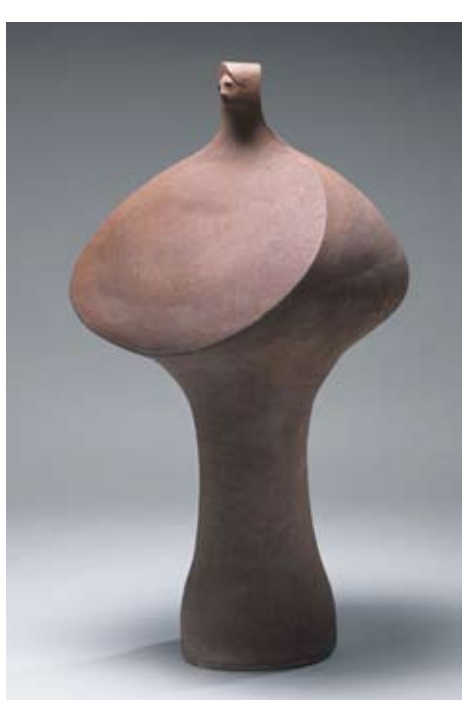
Cloaked Figure by Claude Horan

The Art in Public Places Program cultivates the public's awareness, understanding, and appreciation of visual arts and enhances and beautifies the environment through its displays of the collection in its "museum without walls" installations at state sites and the Hawai'i State Art Museum. Museum hours are Tuesday to Saturday, 10 a.m. to 4 p.m. Always free admission.