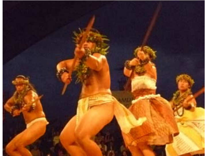
Kapa worn by Halau members on display stands at the ‘Imiloa kapa presentation

On Friday April 29th, a kapa lecture-demonstration at the ‘Imiloa Astronomy Center of Hawai‘i attracted an overflowing audience eager to visit with the kapa makers. The room was set up with selected garments on display as well as “mini-stations” for the dozen kapa makers who shared the various