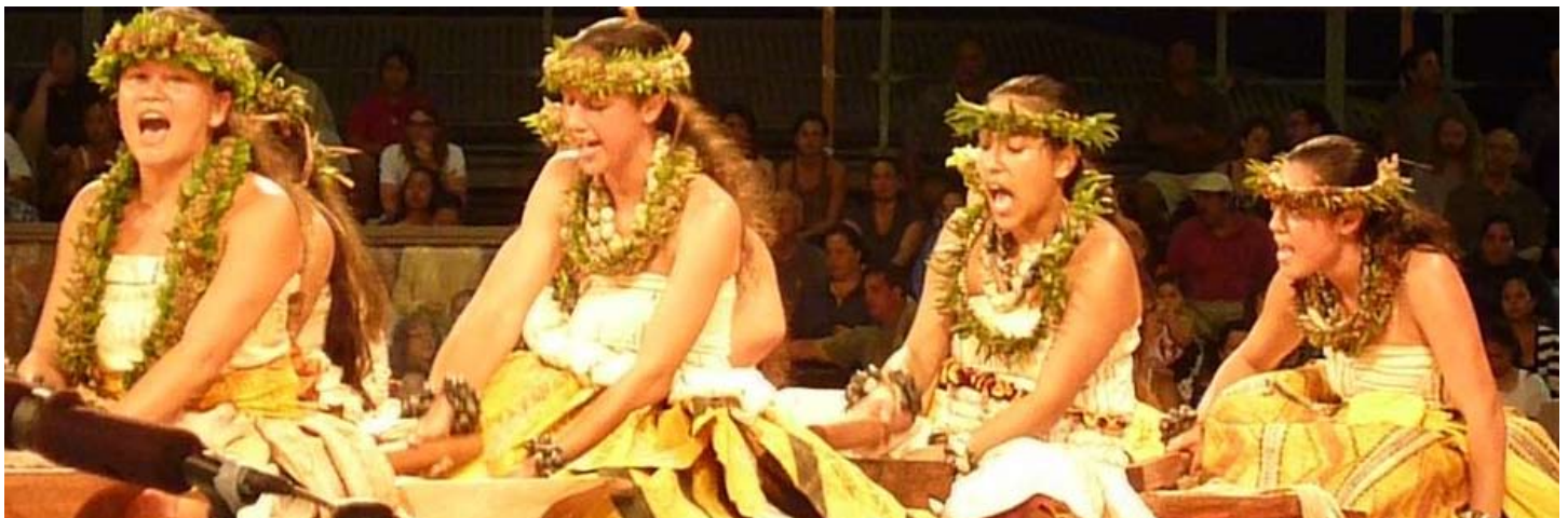
Finale with entire Halau performing hula noho featuring kapa

This is a three-year project, of the State Foundation on Culture and the Arts, a collaboration amongst Halau O Kekuhi and the kapa makers (artists), the Edith Kanaka‘ole Foundation and the Biographical Research Center (project partners), and other community partners around the state. Still in the works are plans for a PBS Hawai‘i documentary by the Biography Hawai‘i production team and statewide outreach to all islands including performances, exhibits, and community activities. Funding in part has been received from appropriations from the Hawai‘i State Legislature, the National Endowment for the Arts, Hawai‘i Council for the Humanities, and project partner resources.