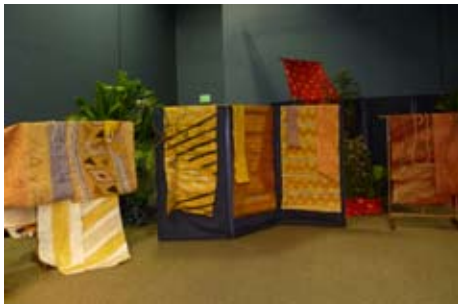
Kapa worn by Halau members on display stands at the ‘Imiloa kapa presentation

Some two dozen kapa practitioners from around the state and one from