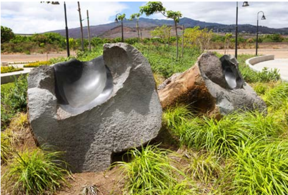
Sculpture at Kapolei Judiciary Center