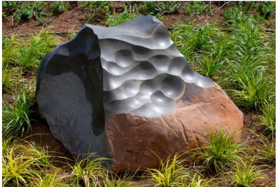
Sculpture at Kapolei Judiciary Center

Miyano's recent series of large basalt sculptures can be seen in Kapolei at the new Judiciary Building.