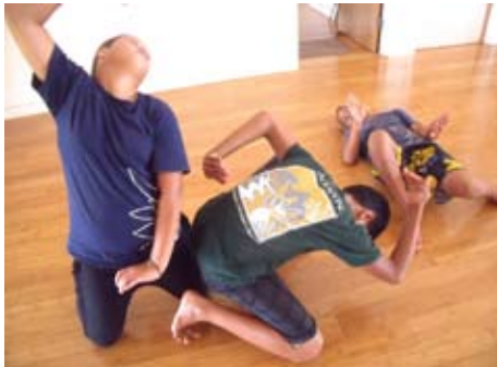
Creative dance residency at Kanuikapono Public Charter School on Kauai.

Public and charter schools state-wide (K-12) are encouraged to apply for a Hawaii State Foundation on Culture and the Arts Artists in the Schools (AITS) Program grant for school year 2014-2015. The program provides grants of up to $6,000 per school for a residency with a teaching artist from the HSFCA Artistic Teaching Partners Roster. The Roster has teaching artists in visual art, dance,