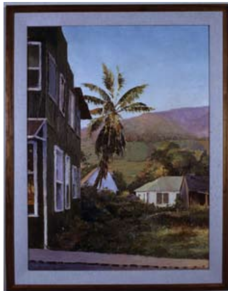
"Fading Light" by Macario Pascual is installed in Representative Chris Lee's office, Room 436

B e sure to come early next month to the First Friday celebration on April 4th for the annual Art at the Capitol event that begins at 4:30 p.m. Selected legislators' offices in the State Capitol will open their doors from 5:00 p.m. until 7:00 p.m. to invite the public to come view their pieces from the state's Art in Public Places collection. Take a self-guided tour through over 50 offices including the Governor's office and the Public Access Room. This year, Art at the Capitol features the art of Otto Piene, the artist of the Sun and Moon light sculptures hanging in the Senate and House Chambers.