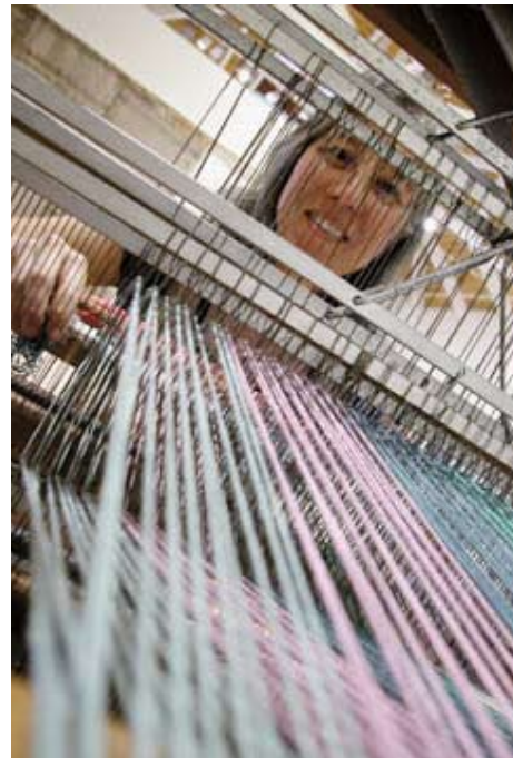
Weaving with the experts