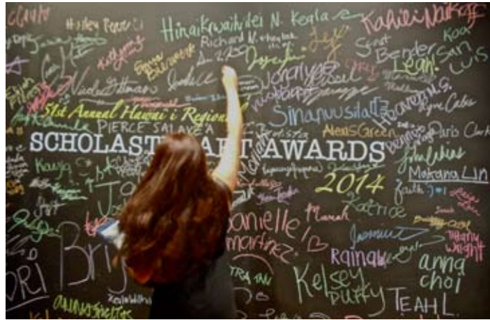
An awardee signing her name at the entrance to the exhibit

To see past national winners, visit the Scholastic Art & Writing Awards online gallery here .