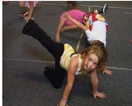
Dancing about the metamorphosis of a butterfly at Connections Public Charter School in Hilo.

"The students could not wait to have your class, and they wanted to know more