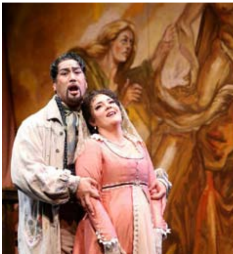
Hawai'i Opera Theatre production of Tosca.