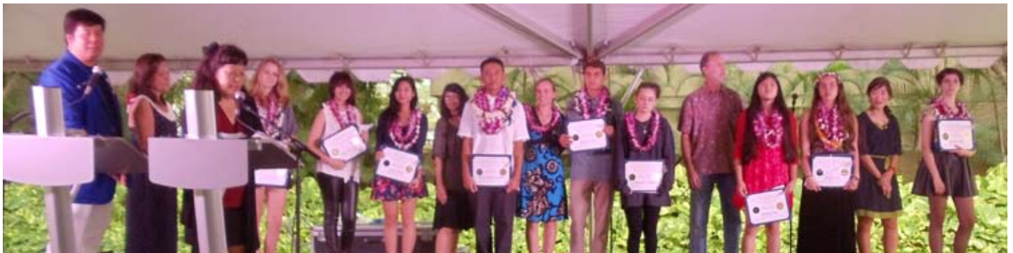
Student winners and their art teachers at the awards ceremony