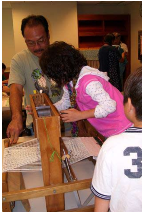
Floor Loom Weaving

Downtown streets aren't crowded on the weekend, so walk, bike, take The Bus or drive to HiSAM on Second Saturday ($3 flat-rate parking across the street at Ali'i Place; enter at 1099 Alakea St. Free parking available at City & County underground lot at Beretania and Alapai.) Come see—it's your art!