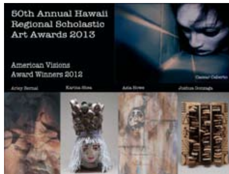
Scholastic Art award-winners