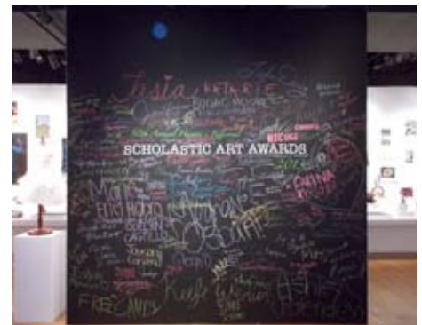
Entrance to Scholastic Art exhibition