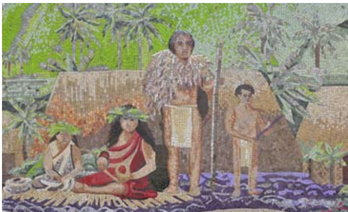
Details from "Ho'ō Pōmaikai'i"