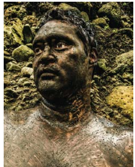
'Natural Distraction' by Hoakalei Dawson