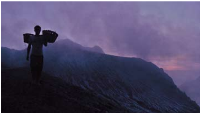
Where Heaven Meets Hell

be back on April 5 with his group "Partners in Time" performing Balkan and Middle Eastern music selections.