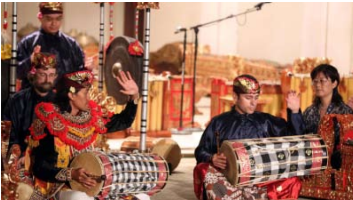
UH Gamelan Ensemble in performance

B ergabunglah dengan kami! Please join us for Balinese Night on March 1st for First Friday at the Hawai'i State Art Museum from 6 to 9 p.m. Enjoy a glimpse into a rich tradition of dance and music with the University of Hawai'i at Manoa's Gamelan