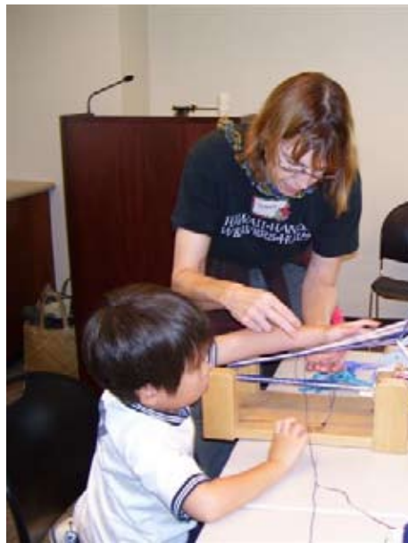
Learn weaving with the Hawaii Handweavers Hui