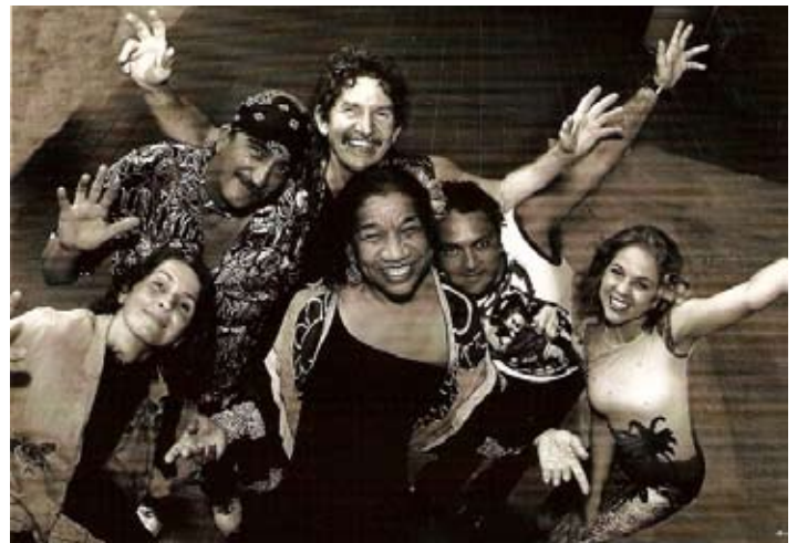
Espiritu Libre performs live on the lanai