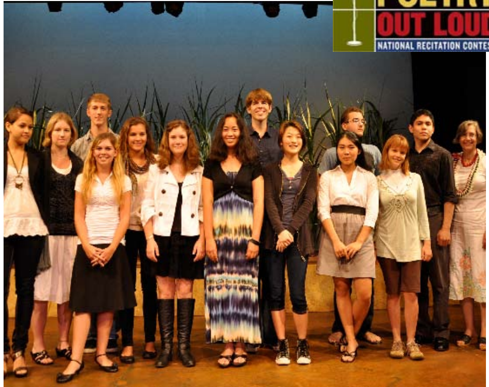
2010 Poetry Out Loud Contestants