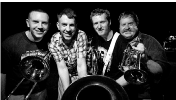
Royal Elephant Brass Band