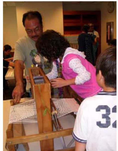
Floor loom weaving