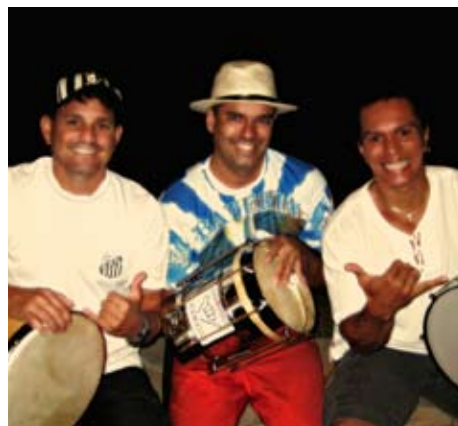
Aloha Brasil (samba band)