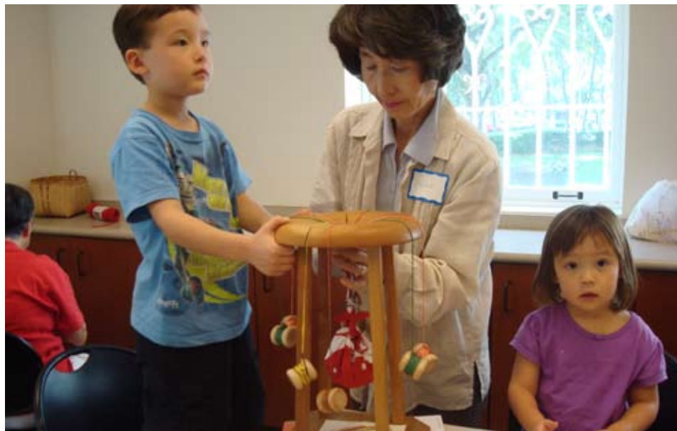
Weaving is fun to learn

This free event is presented by the Hawai'i State Foundation on Culture and the Arts and the Friends of the Hawai'i State Art Museum. While you are at HiSAM, enjoy the beautiful art in our galleries. You and your keiki will love seeing the 47th Annual Hawai'i Regional Scholastic Art Awards 2010 . If you are hungry, enjoy a delicious meal at Downtown @ the HiSAM, the restaurant located on the first floor of the museum.