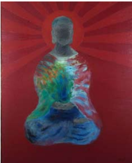
Enlightenment , oil painting, 1965, by Isami Doi, located in Rm. 409, Senator Colleen Hanabusa

Art in Public Places Collection- the people's art. The Capitol provides a prominent and symbolic venue to display the state's art collection increasing access to the arts, and supporting and promoting local artists. Several featured artists at the Capitol will be on hand to meet and greet visitors. This event will take place on Friday, March 5, 2010 from 5:00pm – 7:00pm.