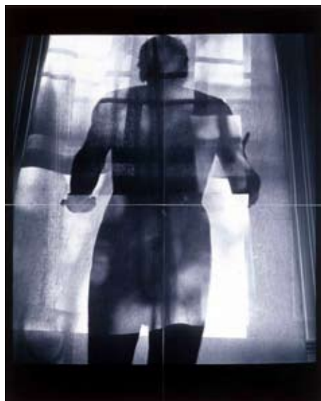
Franco Salmoiraghi, Body Quadrants: Dream Search for the Seat of the Soul , toned silver gelatin print, 1997