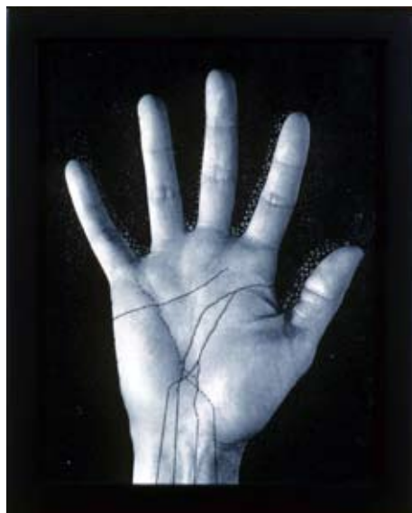
Renee Iijima, Destiny , Xerox, graphite, color pencil, wood, mirror, thread, 2000

Downtown @ the HiSAM serves lunch with casual in-house dining and deli-style takeout. The restaurant may also be booked for private functions. It is open for lunch on Monday to Saturday from 11 a.m. to 2 p.m. and for dinner on First Fridays from 5:30 to 8:30 p.m. Reservations are recommended; call 536-5900.