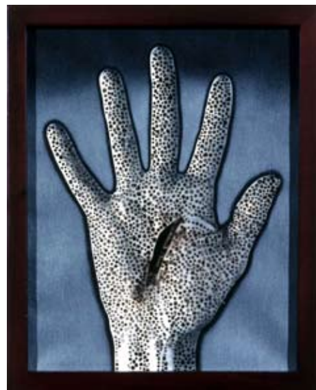
Renee Iijima, The Glove , Xerox, graphite, color pencil, wood, mirror, 2000