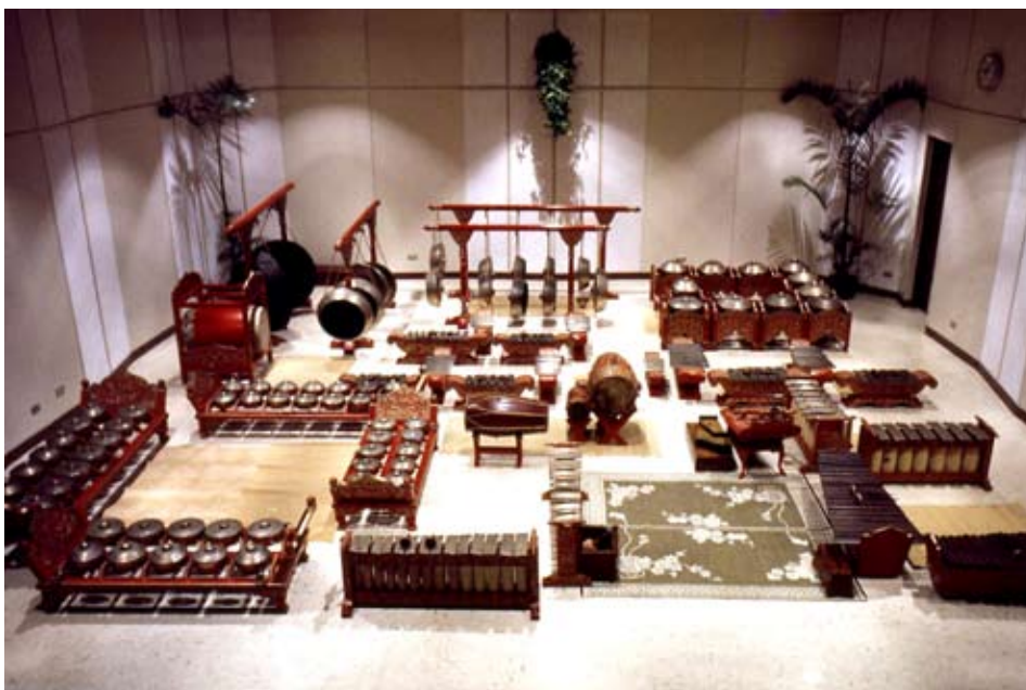
The University of Hawai'i Gamelan Ensemble will perform hypnotic melodies using the instruments of an Indonesian indigenous "orchestra" shown above.

and the Friends of the Hawai'i State Art Museum. The program is produced by Tim Bostock Productions.