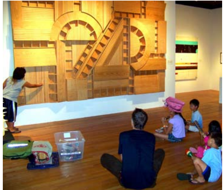
Visit the Hawai'i State Art Museum for a special tour connecting the arts with storytelling and music at Second Saturday on March 14th.

Downtown streets aren't crowded on the weekend, so walk, bike, take The Bus, or drive to HiSAM on Second Saturday. Parking at Ali'i Place is only $3 all day on Saturday. Enter the parking lot on the right side of Alakea Street between King Street and South Hotel Street. Free parking at the C&C underground lot at Beretania and Alapai. Metered parking at 'Iolani Palace is $1 per hour.