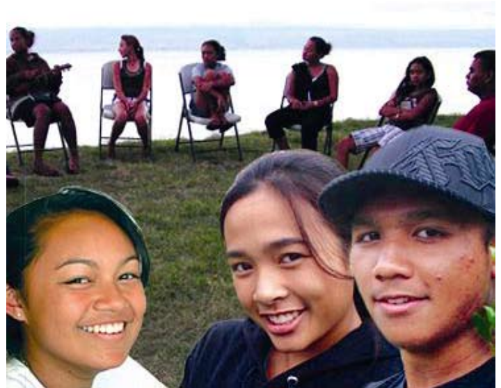
A concert featuring students of Young Voices: the Stories and Music of Lana'i's and Molokai's Youth , will be held at Paliku Theatre at WCC on Saturday, April 25th.

For more information on these events, call 956-8246. For tickets for the O'ahu concert, click here or call the UH Ticket Hotline at 944-BOWS. You may purchase tickets in person at Stan Sheriff Center, UH Campus Center, WCC OCET Office, or Rainbowtique stores. Tickets will be available at Paliku Theatre on April 23rd (day of performance) starting at 6:30 p.m.