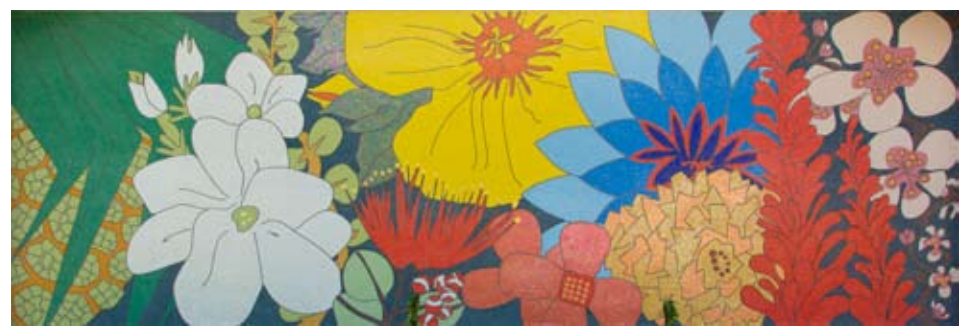
Close up detail of Mohala Pua No Ho'ona'auao