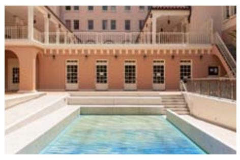
Current Sculpture Garden that references the original pool with a dual layered glass sculpture by Doug Young

people as an "exemplary preservation effort." Honorees for the project are Group 70 International, Hawai'i State Foundation on Culture and the Arts, State of Hawai'i Department of Public