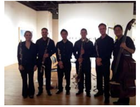
HYS alumni musicians from 2013 performance

In May, the Black Reds transformed the second floor Sculpture Lobby into a jazz night club with their blend of