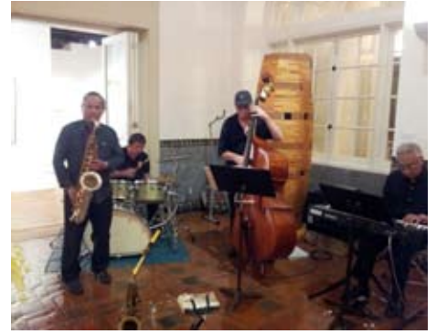
The Black Reds

mainstream jazz, bossanova, blues and funk. The music and the atmosphere even inspired a few couples to get up and dance! Many visitors listened to jazz as they walked through the galleries viewing exhibits "He Makana", "accession" and the ongoing exhibits