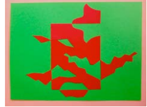
derground lot at Beretania and Alapai.) Come see-it's your art!

Ali'i Place; enter at 1099 Alakea St. Free parking available at City & County un-