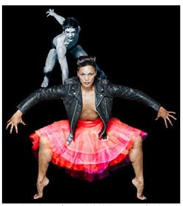
Atamira Dance Company from New Zealand.

For more information about the UH Outreach College, see their website at <a href="www.outreach.hawaii.edu">www.outreach.hawaii.edu</a>. When you click on <a href="Asia Pacific Dance Festival">Asia Pacific Dance Festival</a>, you will be able to see the festival schedule and how to buy tickets. For more information about the dance festival, you can also call 808-956-8246.