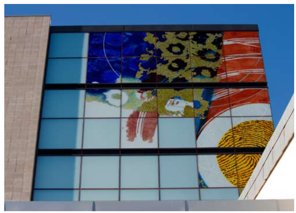
Cycles, Carol Bennett

The State Foundation commissioned Bennett to create Cycles, a multi-level, large-scale, fused glass and LED artwork installed on the library tower. Bennett chose to take advantage of the 360 degree visibility; images on the north face reflect the ocean view and