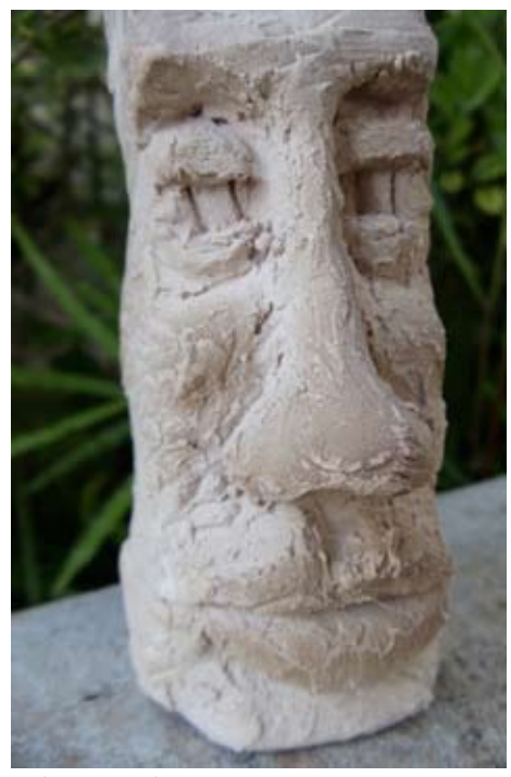
Little Big Head