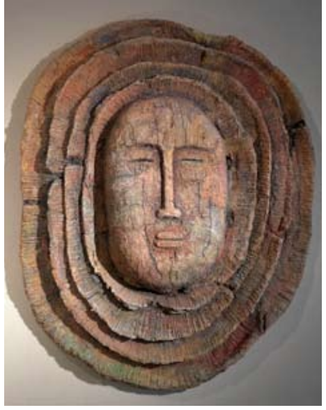
Reflection in Time (Mask1)