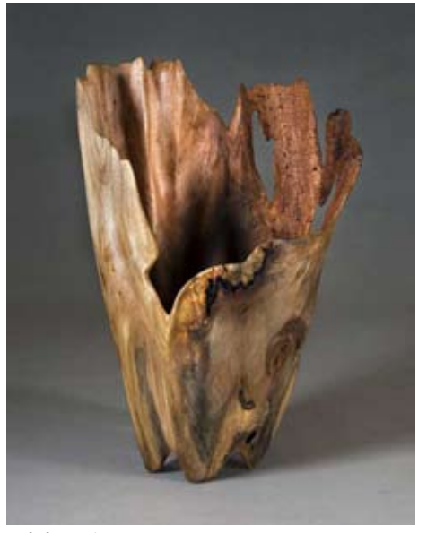
Gift from the Heart

Art Lunch is held in HiSAM's Multipurpose Room on the first floor of the historic No. 1 Capitol District Building located at 250 South Hotel Street.