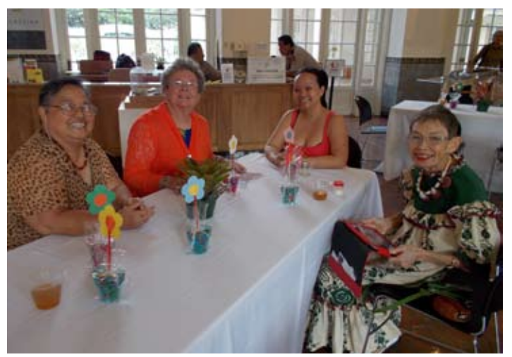
Volunteer appreciation dinner

pril was National Volunteer Appreciation Month and the Hawai'i State Art Museum honored its volunteers with the annual Volunteer Appreciation dinner held on April 20, 2013. It was a fun night enjoyed by all with great food and a trivia game for volunteers. Showing off their knowledge of the Hawai'i State Foundation on Culture and the Arts, Art in Public Places collection, and HiSAM, were SFCA Commissioners, Friends of HiSAM Board members, and of course, our amazing volunteers! The Hawai'i State Art Museum would like to thank Gourmet Events Hawai'i for the delicious food, the Friends of HiSAM for their support, all the people who donated prizes and time, and the State of Hawai'i for hosting this memorable event. Mahalo to you all!