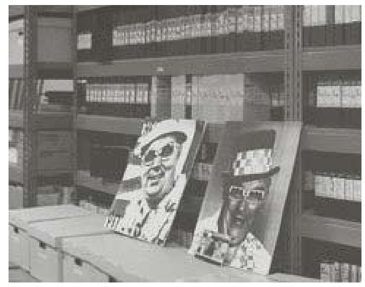
'Ulu'ulu Archives – photo courtesy 'Ulu'ulu

Please RSVP if planning to attend the workshop by calling Helen Redburn at 586-0306. The workshop will be held in the Multi-Purpose Room located on the first floor of HiSAM.