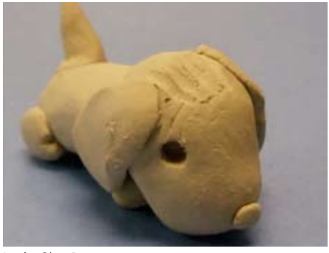
Little Clay Pup