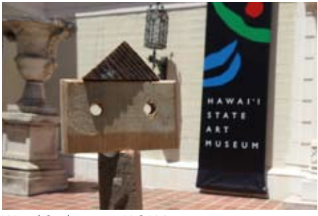
Wood Sculpture at HiSAM