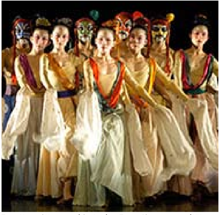
Taipei National University of the Arts from Taiwan.

HSFCA has shared a decades-long working relationship