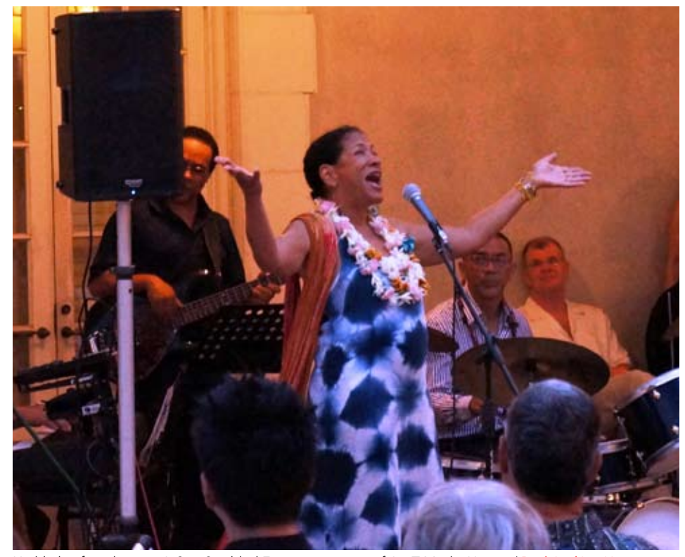
Highlights from last year's Star-Studded Evening www.hawaii.gov/sfca

HiSAM would like to again thank the Hawai'i Youth Symphony for gracing us with their talent in June. Performing was the Hawai'i Youth Symphony's Alumni Chamber Music Series, with seasoned musicians and also recently graduated artists.