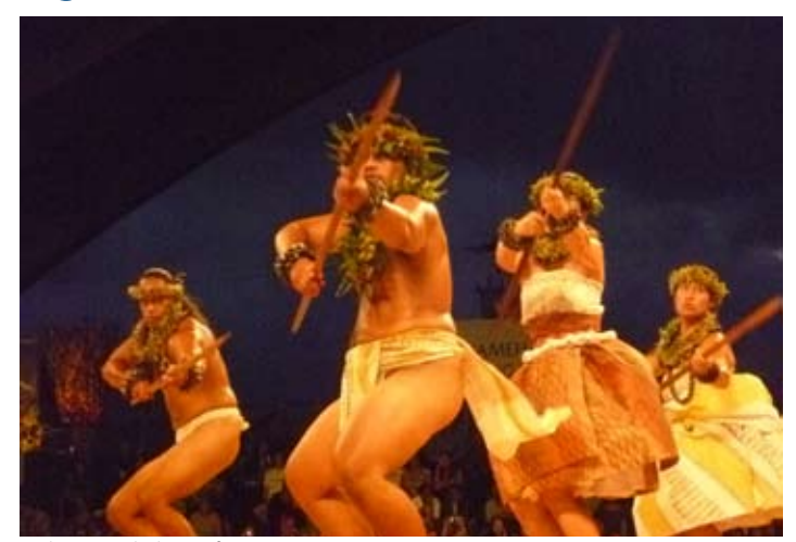
Halau O Kekuhi performance

Our current project partners include the Biographical Research Center and its production team, that will produce the kapa documentary, with a completion date in late spring 2014. BRC's credits include the Biography Hawai'i Series.