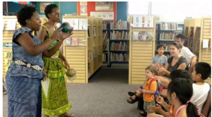
Badenyaa with African Music and Dance

A production of the University of Hawai'i at Manoa Outreach College's Statewide Cultural Extension Program, HSFCA partners with SCEP for annual presentation and touring outreach activities statewide, with funding from the National Endowment for the Arts, the Hawai'i State Foundation on Culture and the Arts, and the Friends of the Library Hawai'i. Presentations may include music and dance from several cultures, Chinese arts and crafts, storytelling, jazz, and modern dance. The schedule for the month of July is as follows (consult your local library for any changes):