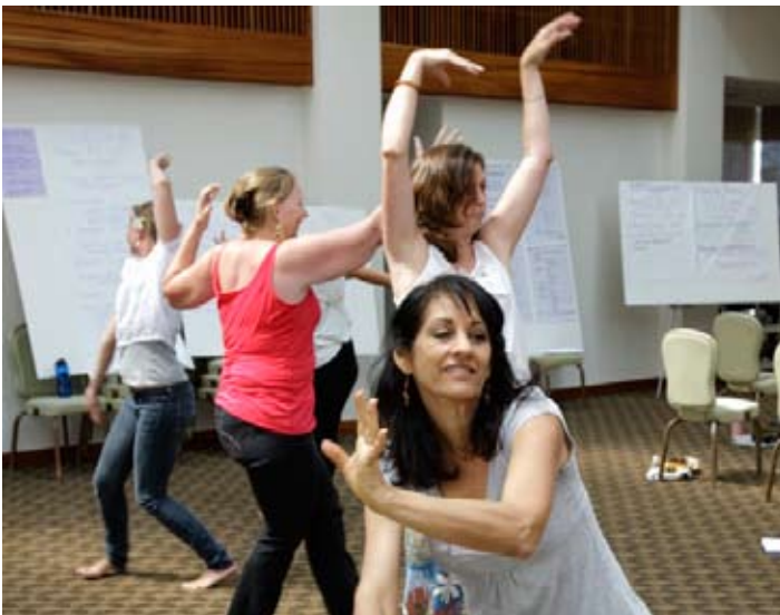
Pomaika'i Elementary teachers dancing the story