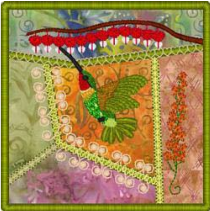
Hawaii Quilt Guild