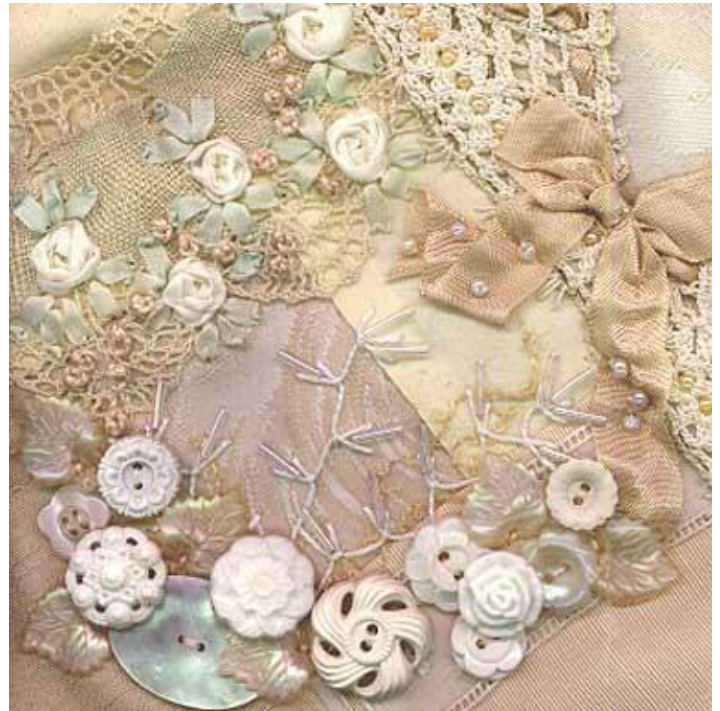
Hawaii Quilt Guild