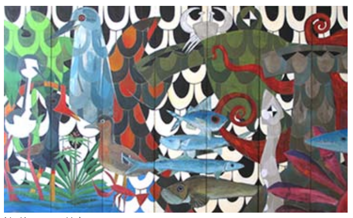
Nā Kūpuna o Helumoa

have created dynamic works of art for the Sheraton Waikiki and for two collaborative shows at the MAMo Gallery in July and Sub-Zero/Wolf Showroom in August.