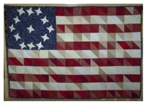
Make a fabric postcard with the Hawaii Quilt Guild

Downtown streets aren't crowded on the weekend, so walk, bike, take The Bus or drive to HiSAM on Second Saturday ($3 flat-rate parking across the street at Ali'i Place; enter at 1099 Alakea St. Free parking available at City & County underground lot at Beretania and Alapai). Come see—it's your art!