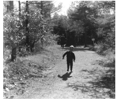
Exploring the Karuizawa paths, Spring, 1943

freelance photographer for fifteen years in New York, and has also taught at Seoul Institute of the Arts, University of Tsukuba and at Kapiolani Community College.