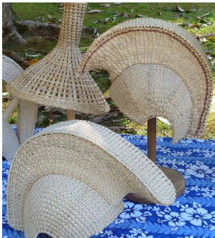
'le'ie Weaving (apprenticeship project)