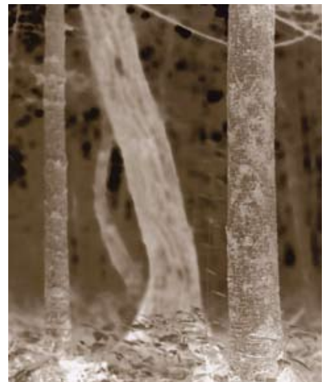
Untitled (KD-3), 2011 (Tom Haar)