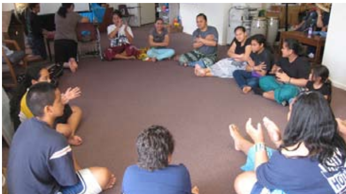
Tokelau language and culture class (culture learning project)

For information about HSFCA's Folk & Traditional Arts Program and its Folk & Traditional Arts Grants or to download the guidelines and application forms (after January 7, 2013), visit the HSFCA website, www.hawaii.gov/sfca . It is highly suggested that applicants discuss their project with staff before submitting the application; contact phone is 808 586-0771.