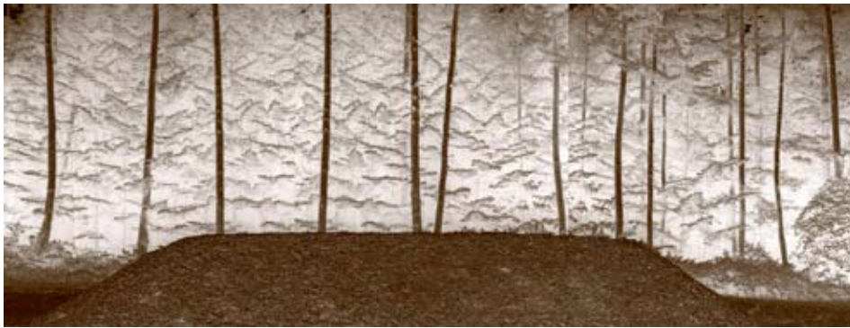
Untitled (KD-23), 2011 (Tom Haar)