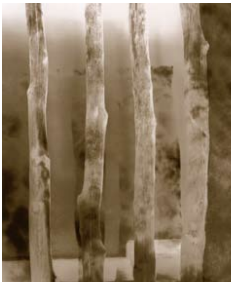
Untitled (KD-5), 2011 (Tom Haar)