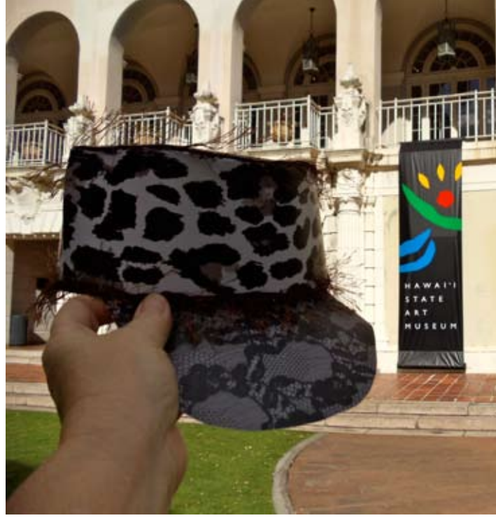
Hats off to the Arts!