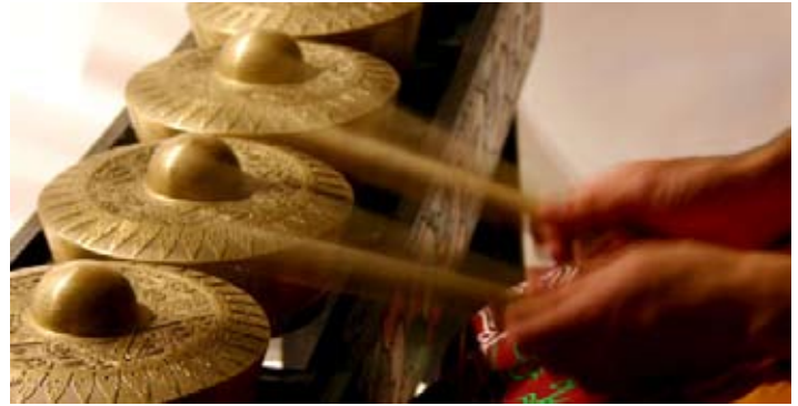
Students in the world music ensembles from the UH Ethnomusicology Program will play exotic instruments such as the kulintang shown above.

While you are at the museum, you can see the beautiful art which is on display in our art galleries. If you are hungry, you can enjoy a delicious meal at Downtown@ the HiSAM, the restaurant located on the first floor of the museum.