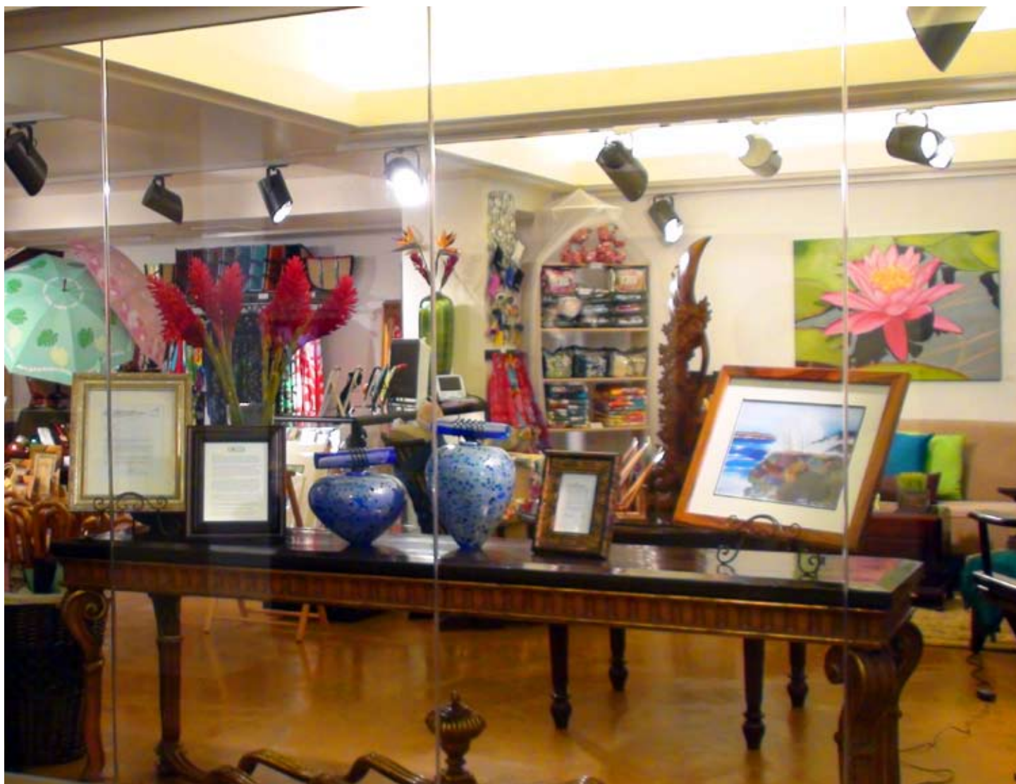
Showcase Hawai'i, the new TV studio/retail shop on the first floor of the Hawai'i State Art Museum sells high quality, locally produced products, as well as national and international brands and gallery art. Showcase Hawai'i is Hawai'i's new home shopping show where viewers can buy and learn about new products and services produced by local businesses.

Shot in high definition, Showcase Hawai'i is broadcast in Hawai'i on channels OC16, HD 1016 and Digital 96. In addition to multiple airings per week, stories are available online 24/7 at www.oc16.tv . For more information on the TV program and the store, visit www.showcasehawaii.tv , call (808) 728-6388, or email contactus@showcasehawaii.tv .