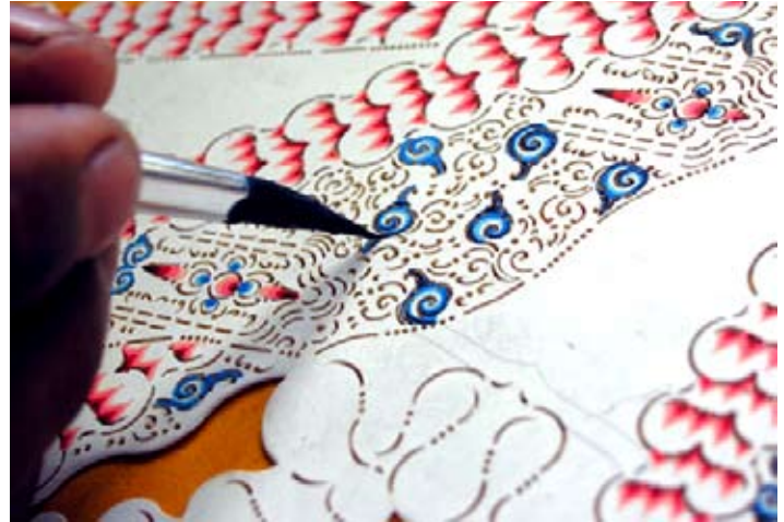
Guests will receive arts demonstrations and learn how to make their own shadow puppets to take home.