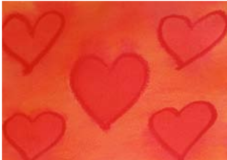
Love multiplies everything!