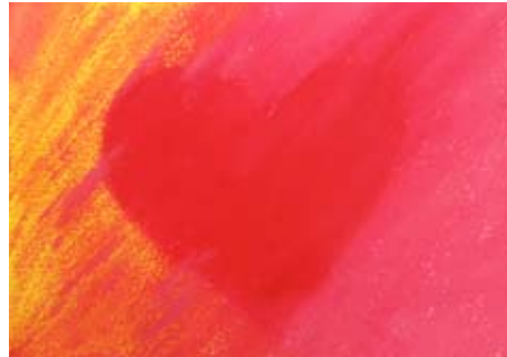
My beating heart