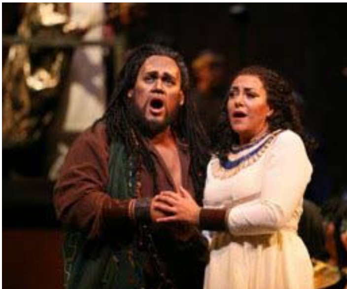
Scenes from the Aida dress rehearsal

The Hawai'i State Art Museum thanks PACKids & Company for their lively showcase in January, a great start to our 2013 performances at HiSAM. Special mahalo to the vocalists and talented solo 'ukulele player.