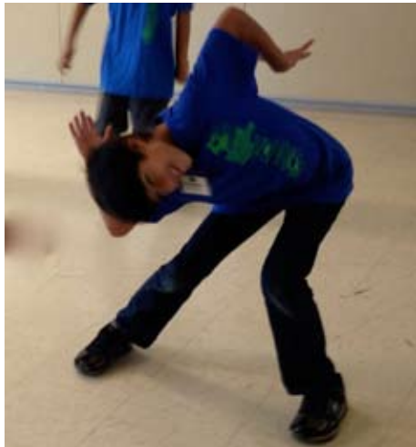
AITS dance residency with Maui Dance Council

With so few arts specialists in Hawaii schools, especially at the elementary level, the AITS grants are an opportunity to give children a joyful hands on experience with the arts: creating, performing/sharing, and reflecting/responding.