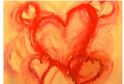
The pentimenti of love