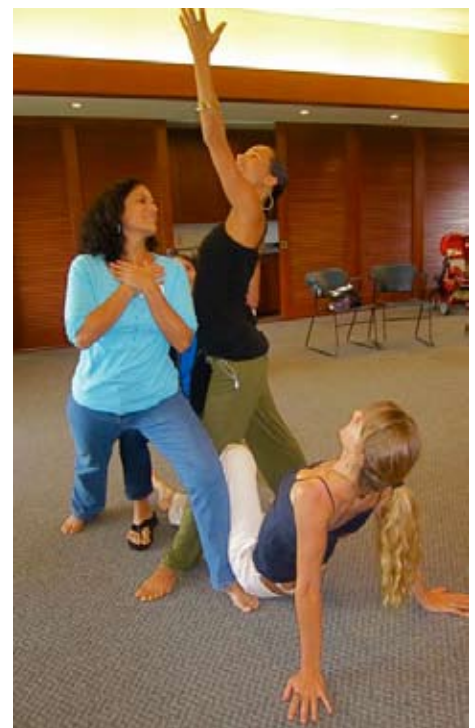
Teaching artists participating in ARTS FIRST Professional Development Workshop at Maui Arts and Cultural Center

Saturday, February 25, 2012 Maui Arts and Cultural Center 9:30 am - 12:30 pm