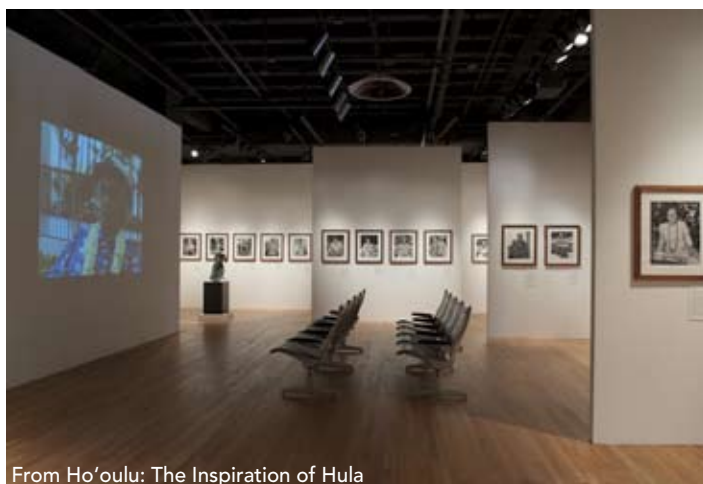
From Ho'oulu: The Inspiration of Hula

Hawai'i STATE ART MUSEUM, COME SEE, IT'S YOUR ART!