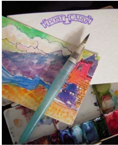
Make postcards with the Hawaii Watercolor Society