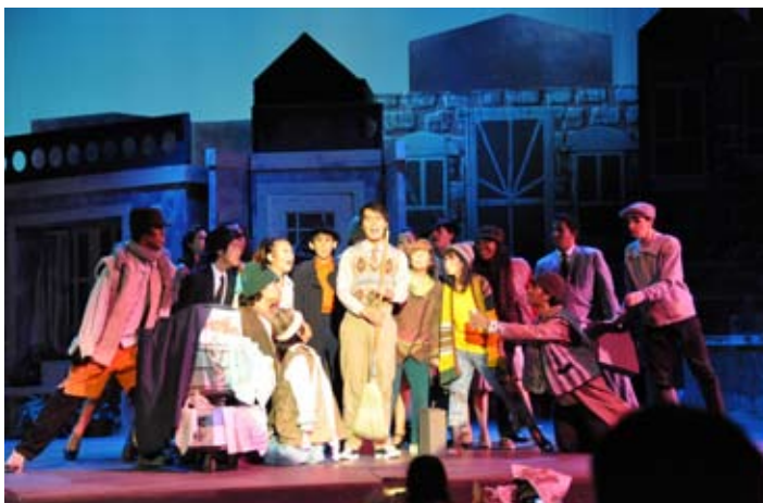
Talented students from Kaimuki High School will perform excerpts from Pirates of Penzance