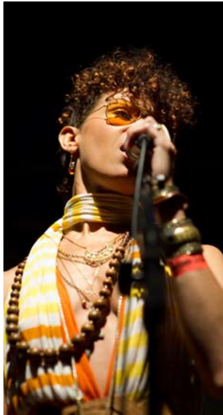
Acclaimed poet Bridget Gray will perform on the lawn and lanai