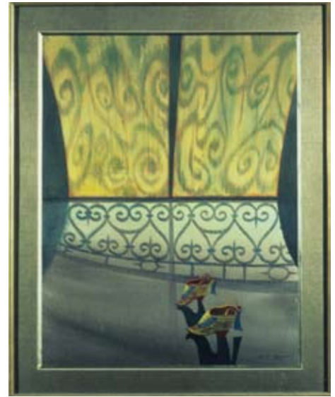
Be inspired by Moonlight, watercolor by Hon-Chew Hee