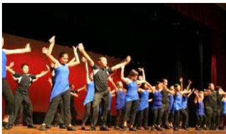
Nanakuli Performing Arts Center members will sing and dance to hits from Broadway