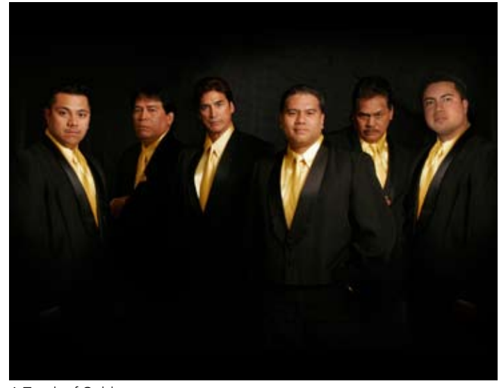
A Touch of Gold

This free event is presented by the Hawai'i State Foundation on Culture and the Arts and the Friends of the Hawai'i State Art Museum. The event is produced by Tim Bostock Productions.