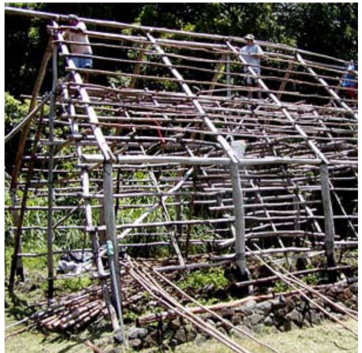
Hale Kutai under construction on Maui