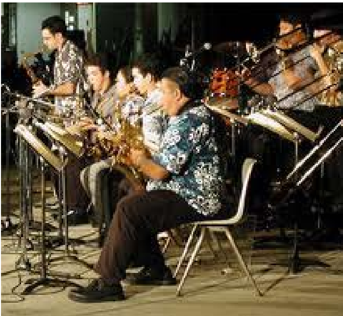
UH Jazz Ensemble