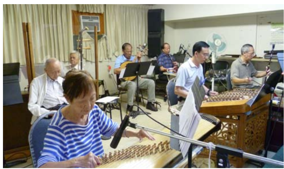
Musicians and singers during their weekly practice.

INFO: August 25, 2013 • Sunday • 2:00 to 6:00 pm • Orvis Auditorium • $10 to $20, Call 808-956-8246 for more information • Tickets are available on line at www.etickethawaii.com, by phone at 944-2697, or visit any UH Ticket outlet (Stan Sheriff Center, Rainbowtique in Ward Center, and UH Manoa Campus Center), service charges apply.