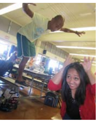
Teachers at the ARTS FIRST Institute experience how drama can engage students in science learning.

Teachers can receive DOE Professional Development