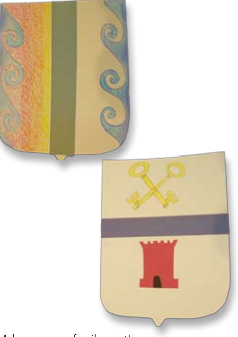
Make your own family crest!