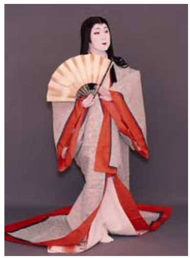
Onoe Kikunobu in Tsuki