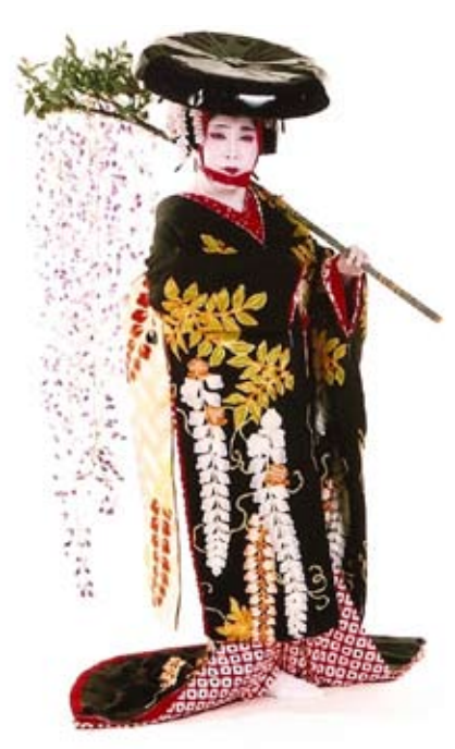
Onoe Kikunobu in Fuji Musume