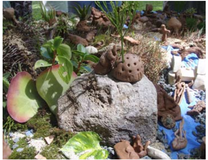
Miniature city in clay