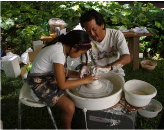
Trying the potter's wheel

Downtown streets aren't crowded on the weekend, so walk, bike, take The Bus or drive to HiSAM on Second Saturday ($3 flat-rate parking across the street at Ali'i Place; enter at 1099 Alakea St. Free parking available at City & County underground lot at Beretania and Alapai). Come see ~ it's your art!