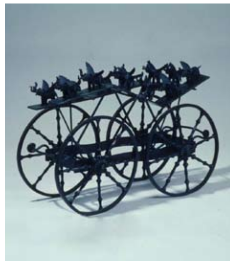
Cloud Chariot #2 by Frank Sheriff