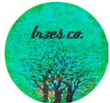
Live from the Lanai with TR3ES CO