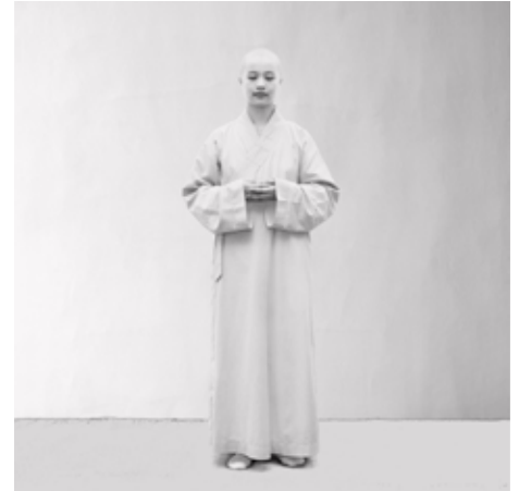
Detail of Just Being