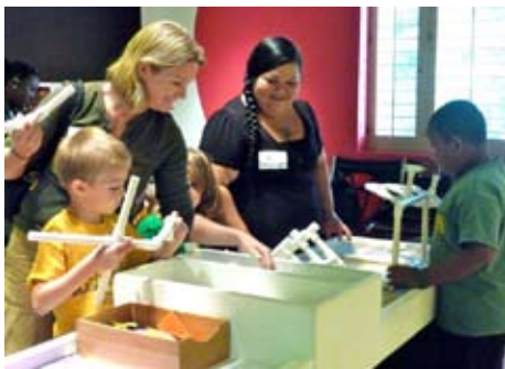
In HiSAM’s I Love Art Gallery: students and parent chaperones learning about the elements and principles of art through exploration

Students, teachers and parents alike expressed the same plan: “I’m coming back to this museum with my family!”