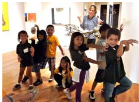
Learning through movement: exploring principles of balance and movement in art as exemplified by the sculpture of Satoru Abe