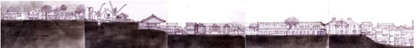
Kloe Kang - Streets 1