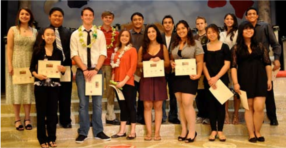
Poetry recitation contestants at the Poetry Out Loud Hawaii State Final