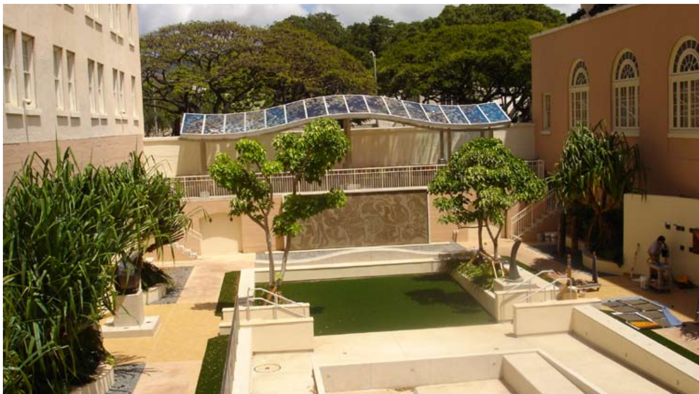
The view from the second floor lanai during the installation and construction of the Sculpture Garden

The Sculpture Garden's opening festivities are on First Friday, May 4, and the garden will be open during regular museum hours, Tues. - Sat. Downtown @ the HiSAM will be serving at tables in the garden, patrons should make reservations in advance for garden seating.