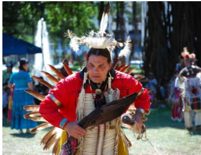
Shown above is a dancer from 808NDNZ, a native American Indian intertribal group based on O'ahu. The group features singers, percussionists, and dancers from several American Indian nations.

Up next on the Lanai Lounge will be the music group Partners in Time. They will perform traditional Balkan and Near Eastern music, primarily Macedonian, Bulgarian, Greek, Armenian, and Turkish. They will also play some Middle Eastern music plus original and jazz-fusion music blending ethnic rhythms, scales, and styles of ornamentation. The band will be joined by Souren Baronian, an Armenian-American musician and composer from New York.