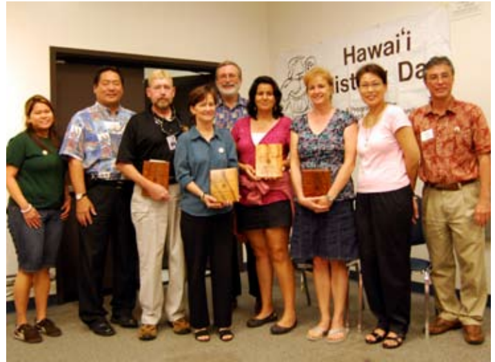
The Hawai'i Council for the Humanities and the HSFCFA will present the Hawai'i History Day Awards at Windward Community College on April 18, 2009. Shown above are last year's award recipients.

At the end of the day, awards will be announced and presented for outstanding students, teachers, and schools. The outstanding schools awards are funded through a cooperative agreement with the Hawai'i State Foundation on Culture and the Arts. For more information about Hawai'i History Day