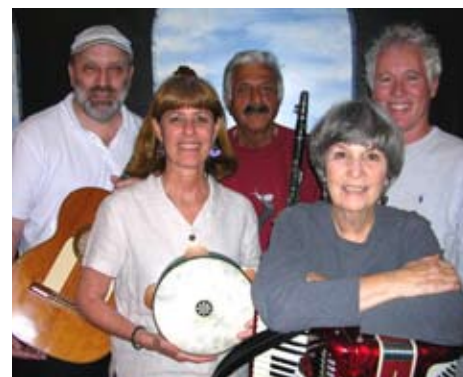
Partners in Time will perform traditional Balkan and Near Eastern music, primarily Macedonian, Bulgarian, Greek, Armenian, and Turkish.