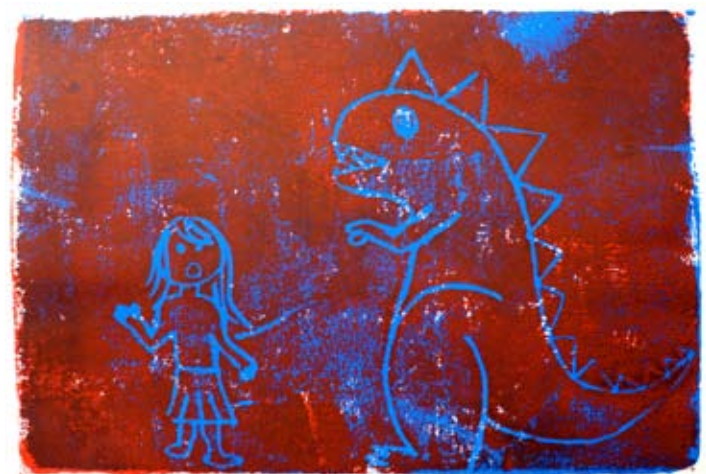
Let your imagination run wild and create your own amazing artwork. Just be sure to watch out for scary dinosaurs!