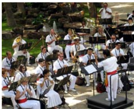
The Royal Hawaiian Band was founded in 1836 by King Kamehameha II, and it is the only full-time municipal band in the United States today.

The Hawai'i State Art Museum is in the No. 1 Capitol District Building at 250 South Hotel Street, on the corner of Hotel and Richards Streets, in downtown Honolulu across from the Capitol. The museum is open Tuesday to Saturday from 10 a.m. to 4 p.m. Admission is free. For more information on the museum, call 586-0900 or visit www.hawaii.gov/sfca .