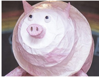
Above is one of the lanterns created by a Kalani High School student for the CID's Taste of Chinatown and Lantern Festival