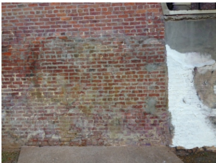
Working towards a Solution

Many thanks to the Atherton Foundation for funding this study and to Mason Architects for conducting the research and product testing.