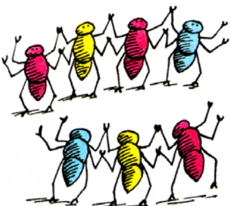
Illustration from The Bug Book