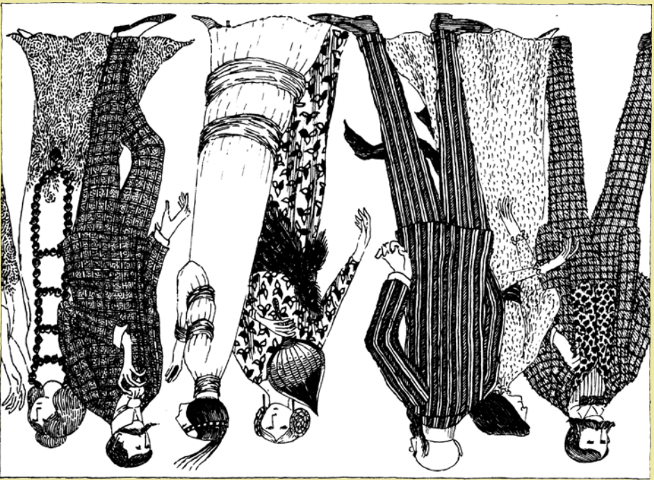
Illustration from The Remembered Visit

He and Miss Skrim-Fshaw mentioned a great many people who had done things in their conversation.