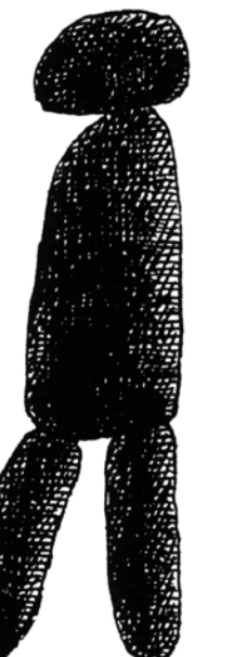
Illustration from The Black Doll

Summary: With a contract to perform a drag show way out in the Australian desert, Tick, Adam, and Ralph each has his own reason for wanting to leave the safety of Sydney. Christening their battered pink tour bus "Priscilla," this wickedly funny and high-drama trio heads for the outback and into crazy adventures in even crazier outfits.