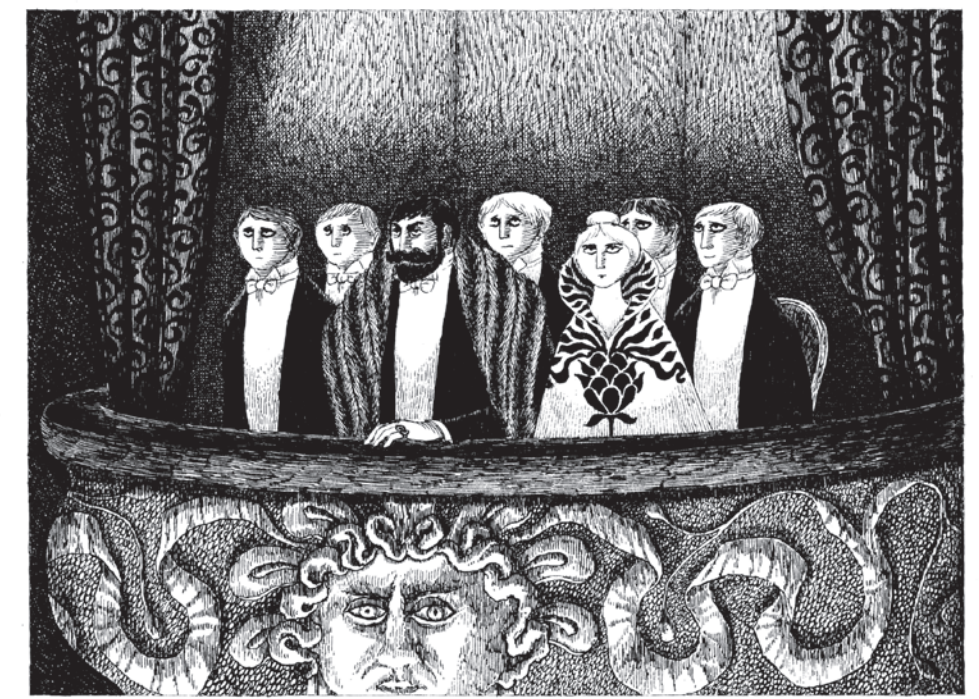
Caviglia's revival of Elagabalus was cut short when the authorities had the curtain rung down on the triple-wedding scene.