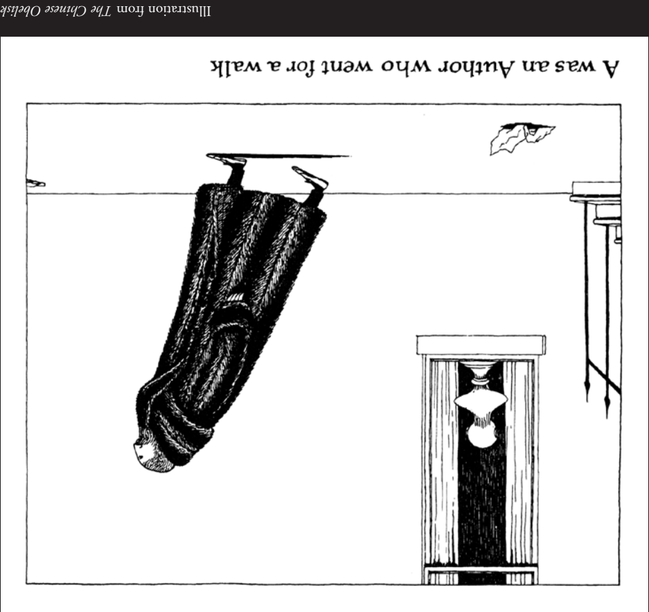
Illustration from The Chinese Obelisk

Non-Profit Organization U.S. Postage PAID Honolulu, HI Permit No. 278 ADDRESS SERVICE REQUESTED