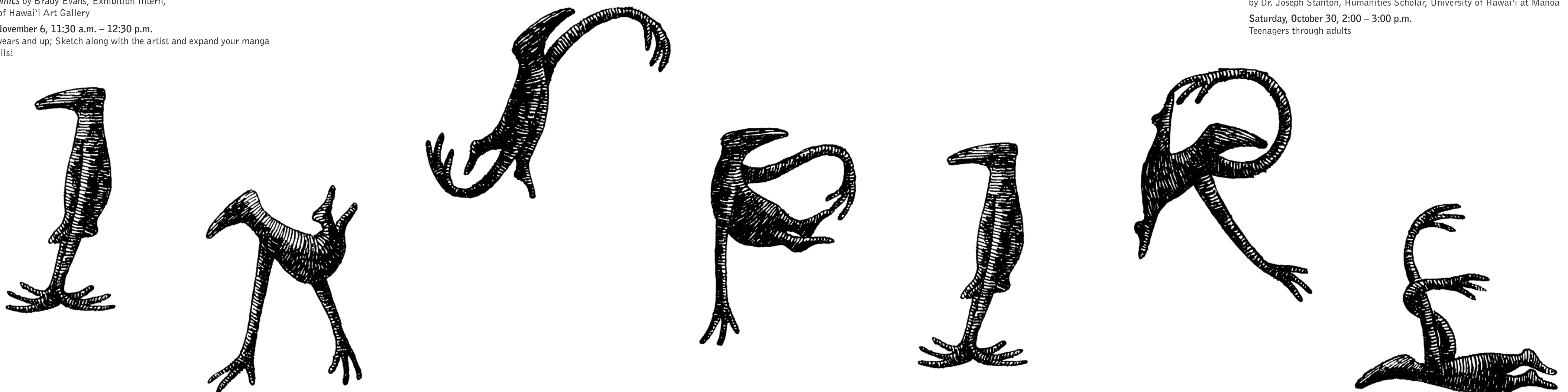
Illustration from Figbash Acrobat