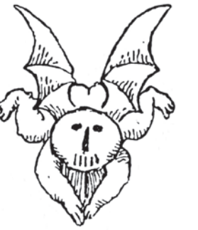
Illustration from Dracula: A Toy Theatre

The Mānoa Readers / Theatre Ensemble productions are sponsored by Outreach College, The Mānoa Foundation, and Mānoa: A Pacific Journal of International Writing, with further support from the University of Hawai'i at Mānoa Department of English.