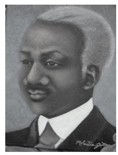
Feb 10 - 28 Honolulu Hale Courtyard

The Obama Hawaiian Africana Museum and The Hawaii Alumnae Chapter of Delta Sigma Theta Sorority present this exhibit that honors America's first president of African descent and born and raised in Hawai'i. It will also feature a variety of art forms promoting peace, including paintings, calligraphy and more.