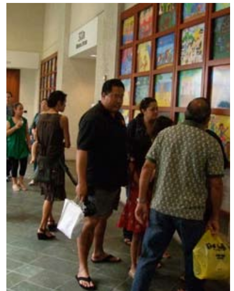
Artworks will be on display for one year in the Pa Kamali'i Courtyard.