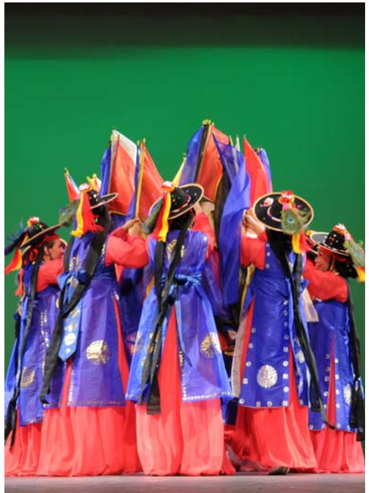
Performance by Halla Pai Huhm Studio Students

The Halla Huhm Dance Collection, Volume One, is housed in the Center for Korean Studies and includes photographs, programs, newspaper articles, correspondence and videos related to the studio and various events in which the Foundation has been involved. A second volume is currently being organized.