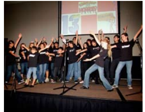
Students from Kapolei Performing Arts Center performed selections from Little Shop of Horrors .