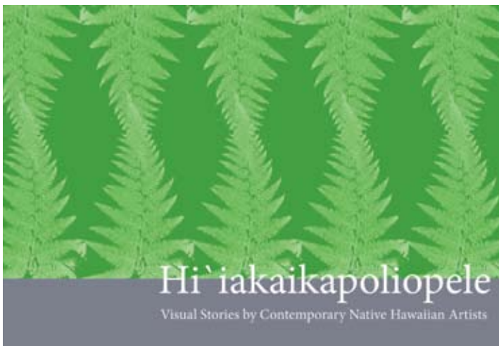
Selections from Hi'iakaikapoliopele to supplement Ho'oulu exhibition

Please join us in celebration of Hi'iaka, the favorite sister of Pele, in an exhibit inspired by the goddess. The Hawai'i State Art Museum presents Hi'iakaikapoliopele: Visual Stories by Contemporary Native Hawaiian Artists , an invitational exhibition organized by Maui Arts & Cultural Center in fall 2009 with partial support from the County of Maui and Kauahea Inc. Five works from this exhibit were purchased for the Art in Public Places Collection. The show runs from May 7 to July 17, 2010, in HiSAM's Turn-around Gallery.